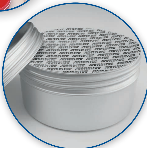
EPE Liner / Flowed-in seal / Pressure sensitive liner Induction heat seal