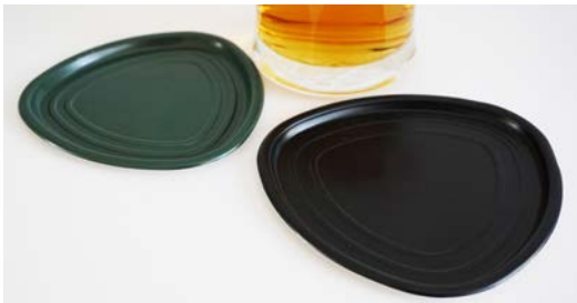
Other Components & Stampings