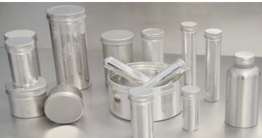
Extruded Aluminium Containers