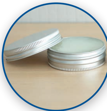
Knurl / Smooth rim