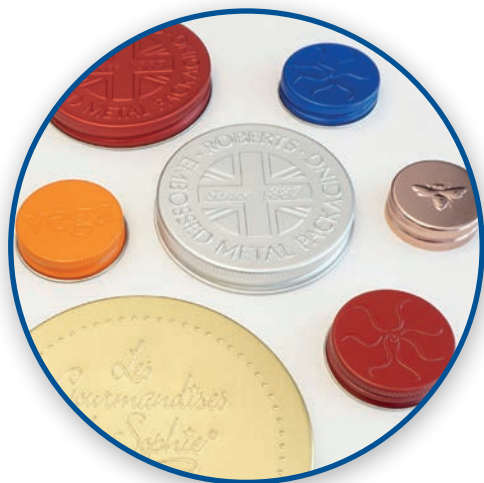
Embossed / Debossed